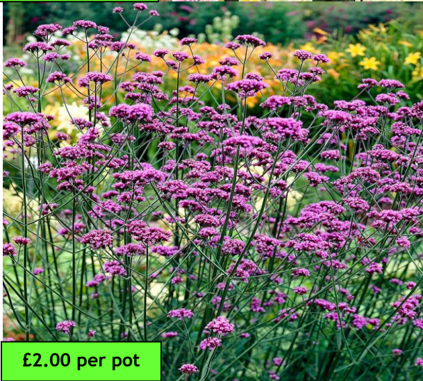
£2.00 per pot