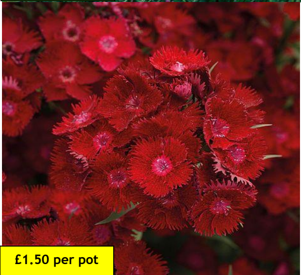
£1.50 per pot