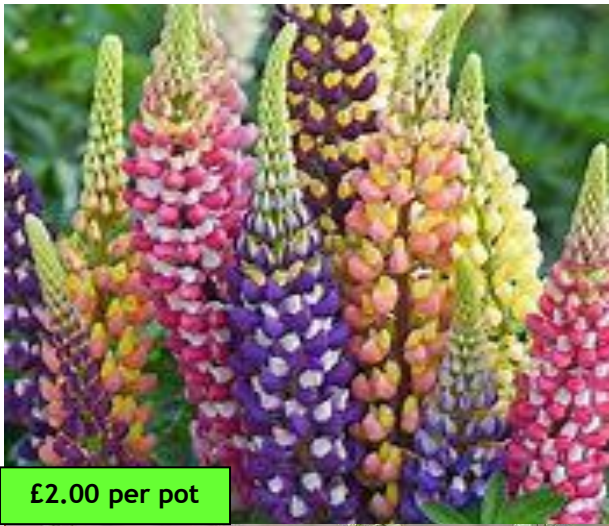
£2.00 per pot