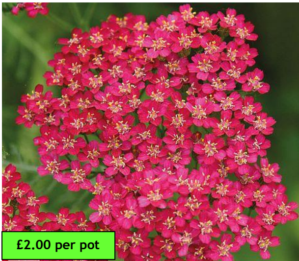
£2.00 per pot