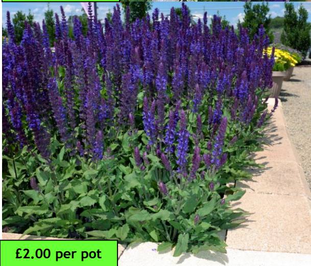
£2.00 per pot