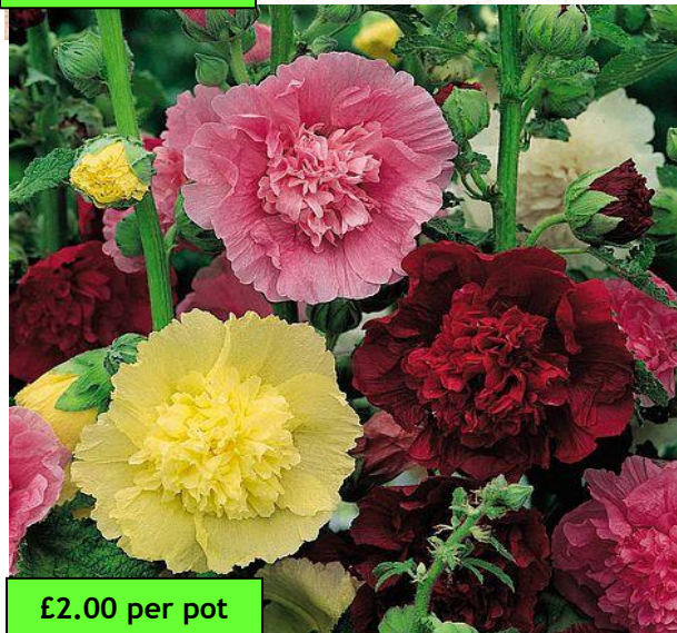
£2.00 per pot