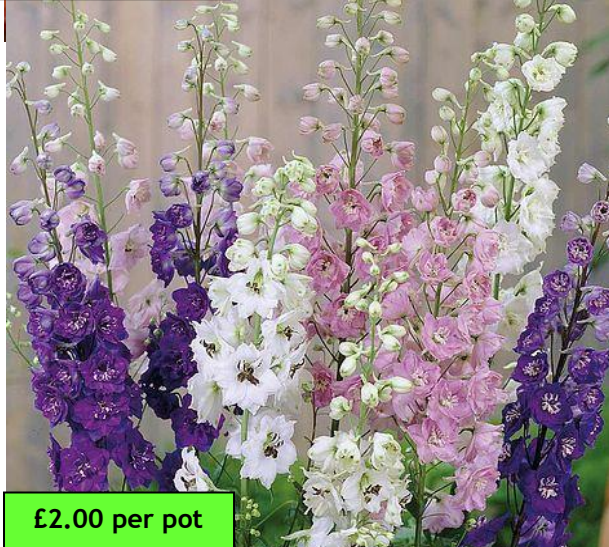
£2.00 per pot