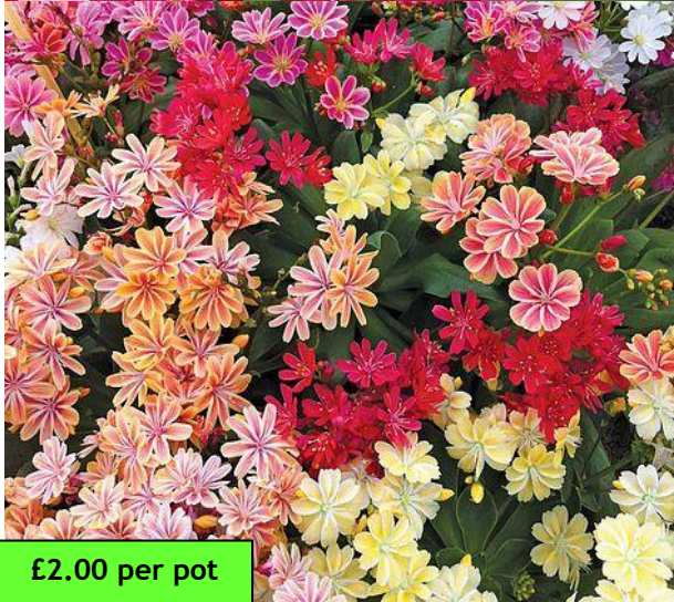
£2.00 per pot